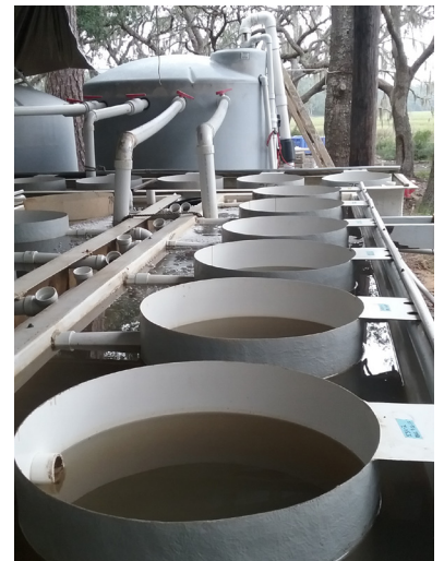
Image: The seed oyster hatchery tank system at Lady’s Island Oyster.

This hatchery now supplies much of the oyster production seeds in the state, which reduces supply chain vulnerabilities and lowers the risk of importing diseases.